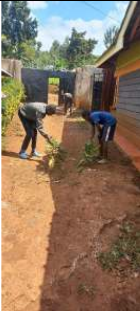
Sweeping the Compound