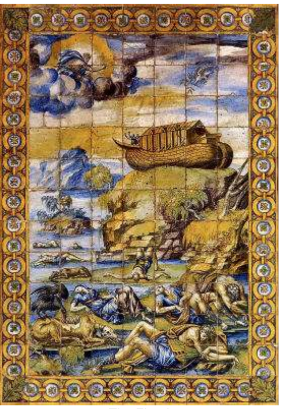
The Flood Masseot Abaquesne

Virtually every culture since the scattering of man at Babel has maintained (in one form or another) a legend of a "great flood." Often, the traditions that sprung from the legend are associated with a period known as "the day of death (the dead)" as well as a "new beginning." These traditions generally occur and are celebrated in the fall of the year.