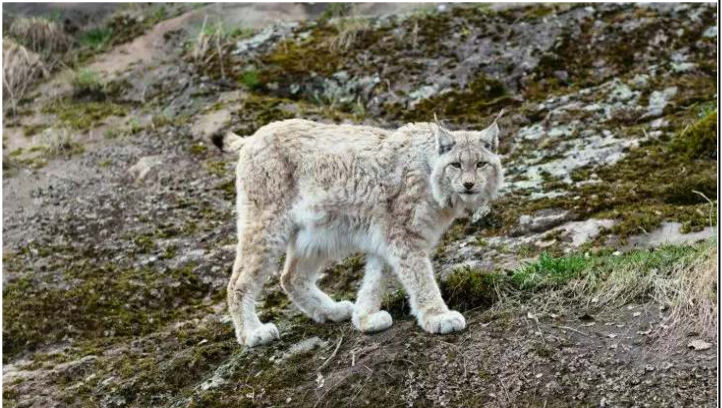
Lynx on a rock

The lynx has always been one of my favorite wild cats, living in the cold northern forest where no other cat could survive. I remember one animal documentary that showed a Canada lynx chasing a snowshoe hare over deep snow. The cat and the hare were evenly matched as they raced over the snow. The lynx was gaining on its prey, but with a quick turn on the hare's part, it was able to escape. I remember being disappointed in the outcome, feeling sorry for this hungry feline.